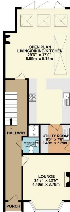
GROUND FLOOR 835 sq.ft. (77.6 sq.m.) approx.